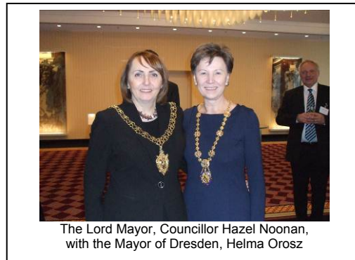
The Lord Mayor, Councillor Hazel Noonan, with the Mayor of Dresden, Helma Orosz